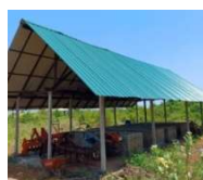
Repairing of Fencing HGRC Atchuvely