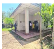
AI Office Nedunkerny