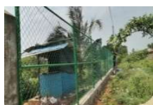
Vermi compost shed HGRC Atchuvely