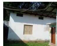
DDA Store Vavuniya