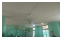
FM Office DATC Jaffna